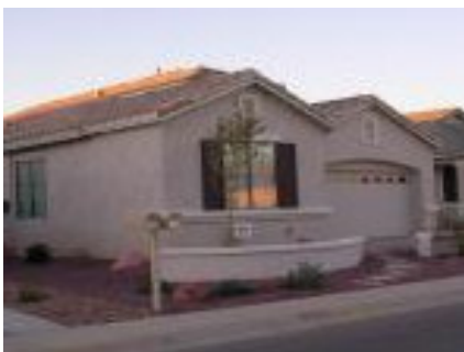
Nice home! Whose home is this? For more information, see the Bulletin Board, page 7

Nothing to report on Gilbert Railroad Park.