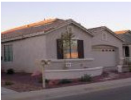
Nice home! Whose home is this? For more information, see the Bulletin Board, page 7

Nothing to report on Gilbert Railroad Park.