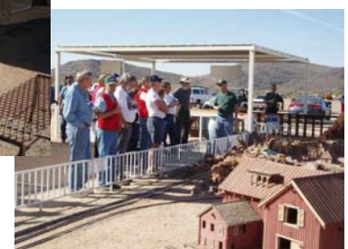
After the meeting, tours of the various railroads were given as well as rides on the 1-1/2” railroad. It will be interesting to see progress being made on the G-scale RR.

This will be an event to be remembered and we will repeat it next Nov.