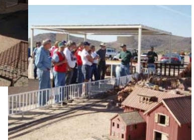
After the meeting, tours of the various railroads were given as well as rides on the 1-1/2” railroad. It will be interesting to see progress being made on the G-scale RR.

This will be an event to be remembered and we will repeat it next Nov.