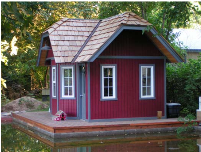
John & Pat's 7/8 scale depot is a big attraction in their garden layout! See it at the March meeting.