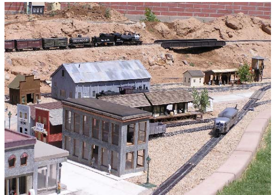
Steve Vendt's RR comes complete with scratch built buildings, a round house facility and lots of room for mountains that have many tunnels and bridges.

These are samples of non ABTO members who will be showing at the 2008 NGRC. There is a lot of talent in the valley and we'll see more on the Convention Tours.