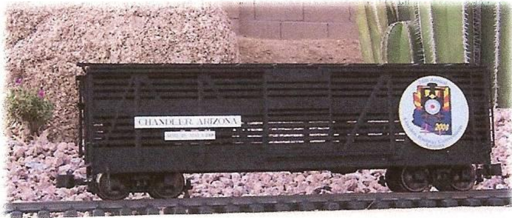
AMS 1:29 scale stock car.

In recognition of the volunteer support at the 2008 convention, the ABTO Board wants to